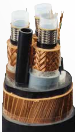
HYBRID CABLE FOR SHALE GAS. Power cable, FTP, optical fiber, cooled. Designed in collaboration with the customer.

Whether is Shale Gas, Tar Sands or Offshore drilling sites, we always find the right solution.