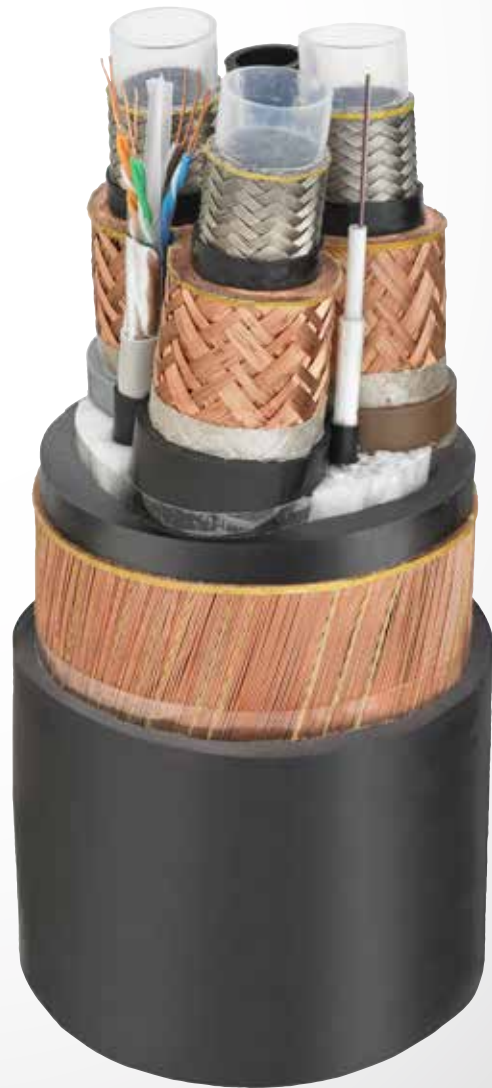
Shale Gas Custom made Hybrid Cable

Safety in these days is an essential value and Oil & Gas industry needs reliable suppliers which can guarantee world class quality levels.