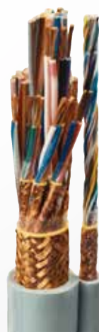
COMPOSITE CABLE Consisting of control and instrumentation cables and electronics cables. The instrumentation cables are shielded with red copper braid on the single pairs and on the total.